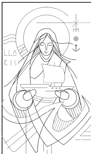
Our Lady of the Stars, Pray for us!